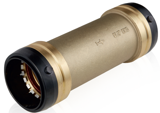
SharkBite 35mm - 54mm