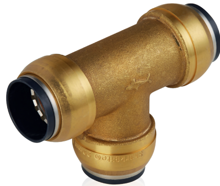
SharkBite 10mm - 28mm

Rigorous manufacturing and quality control, as well as long-term internal product testing, ensure the durability and seamless performance of the SharkBite Air & Pneumatics fittings.