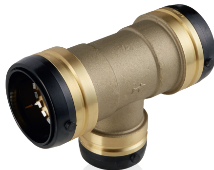
SharkBite 35mm - 54mm